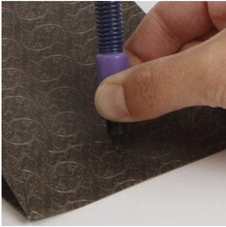
8 Make a hole for the brad with an eyelet tool and attach the brad.