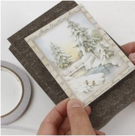
7 Attach this onto the bag using double-sided tape.