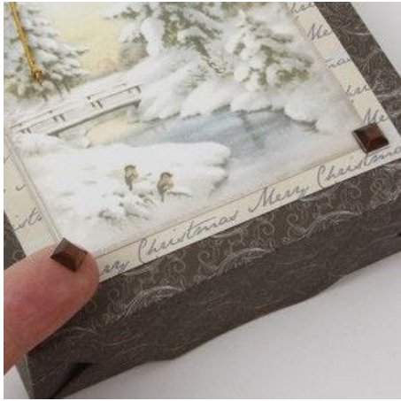
9 Decorate with rhinestones.