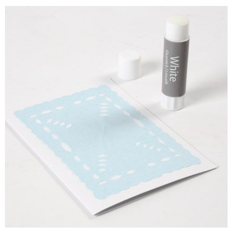
2. Carefully glue the tissue paper with the pattern of holes onto the front of the greeting card. Smooth out