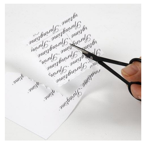
3. Print a text or a verse - black on white paper. Trim the edge with a precision scissors for making scalloped edges and glue this onto the attached tissue paper.