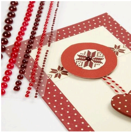
9. Attach a wooden heart sticker and a self-adhesive rhinestone half-pearl. Decorate the peg for hanging with masking tape.