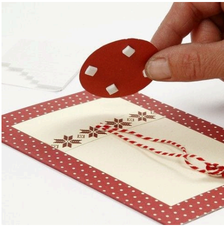
8. Attach this to the greeting card with 3D foam pads.