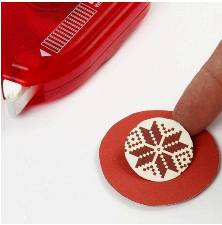
7. Attach the star onto the card circle using E-Z runner.