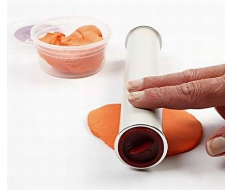
1 Roll out Silk Clay to an approx. \frac{1}{2} cm thickness.