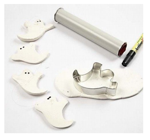
6 Make the ghosts using the same procedure.