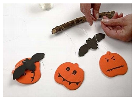
5 Tie the finished shapes onto a branch/stick or simply let them hang freely from a piece of elastic beading cord.