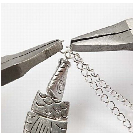
11. Attach the pendant to the chain using a round jump ring.