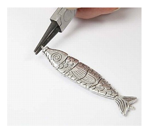
10. Twist to form a loop.