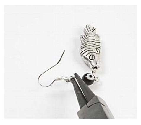
7. Attach a French ear wire to the fish pendant by opening and closing it