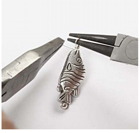
5. Put the silver fish onto a ball head pin. Twist to form a loop using round nose pliers and twist the end of the pin around itself and nip it off.