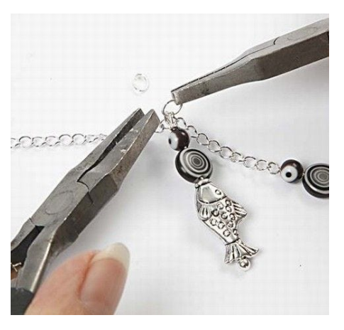
3. Attach the pendant onto the chain with a round jump ring.