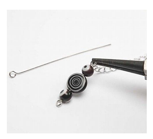
1. Put beads onto an eye pin and attach this to a piece of jewellery chain by twisting the pin to make a loop.