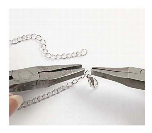
4. Attach round jump rings to both ends of the chain. Attach a lobster claw clasp to one of the round jump rings.