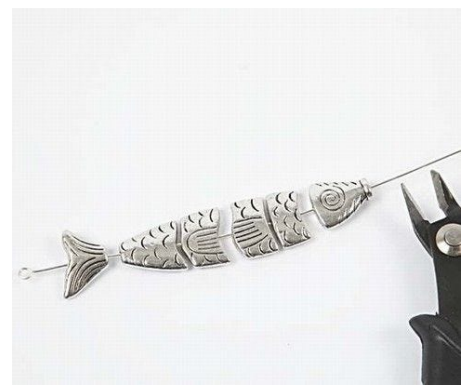
9. Put the fish parts onto the wire and nip off the excess wire leaving approx. 1cm.