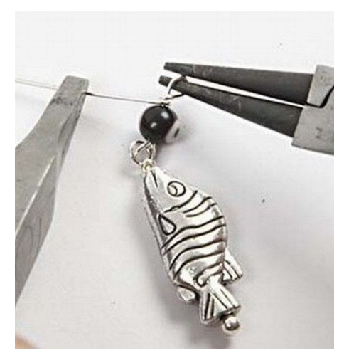
6. Attach an eye pin through the loop of the ball head pin of the silver fish. Then put a bead onto the eye pin, turn the pin around itself and nip it off.