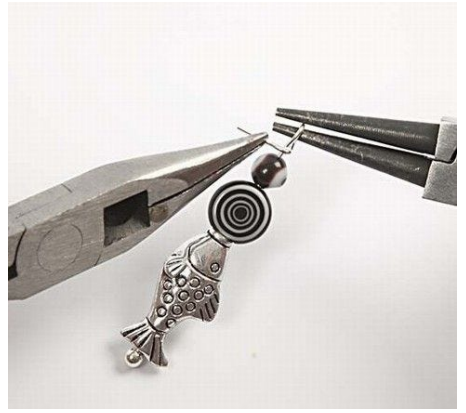
2. To make a pendant, put beads onto a ball head pin, twist to make a loop and twist the end of the pin around itself and nip it off.