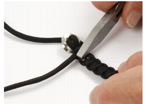
9 Push the ends down immediately – you may use pliers.