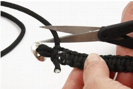
10 Cut off the other two ends at approx. 1.5cm.