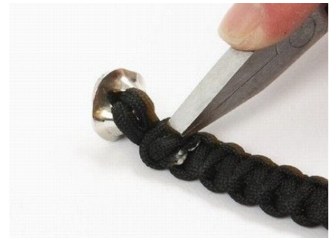
12 Push down immediately.