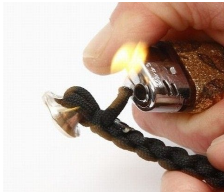
11 Melt the ends.