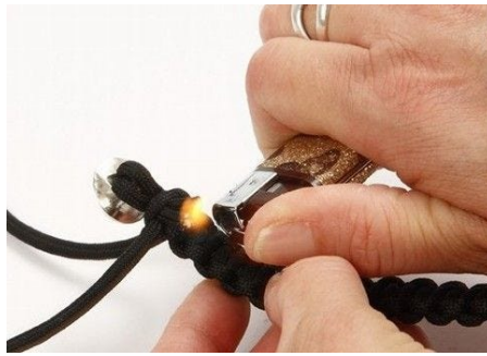
8 Melt the ends carefully.