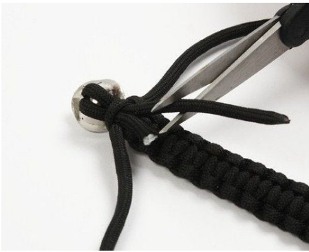
7 Cut off the two macramé cords at approx. 1cm.