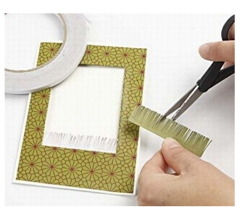
5. Cut two pieces of card - a white and a green - measuring 1.7 x 6.5cm. Cut very thin notches along the long edge in the two pieces of card and attach them both to the front of the card.