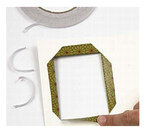
4. Fold the paper around the edges of the cut-out window and attach the paper onto the inside of the window with double-sided adhesive tape.