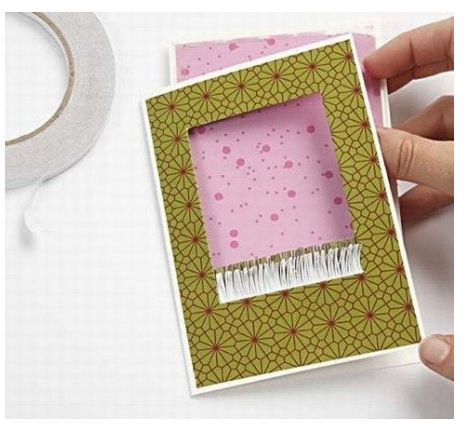
6. Cover the removed punched-out piece of paper (which covered the aperture of the passepartout card) with paper and attach it onto the back of the inside of the gap in the card using double-sided adhesive tape.