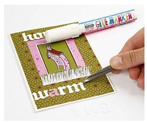
8. Glue on punched-out letters and rhinestones.