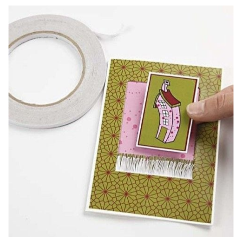
7. Cut out a house from the design paper and attach it to a white piece of card slightly larger than the cut-out house. Attach the house inside the frame of the card.