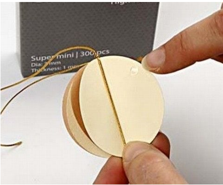
8 Attach a Glue Dot ¼ from the top on the last side.