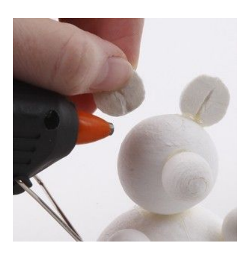
3 Glue these onto the animal.