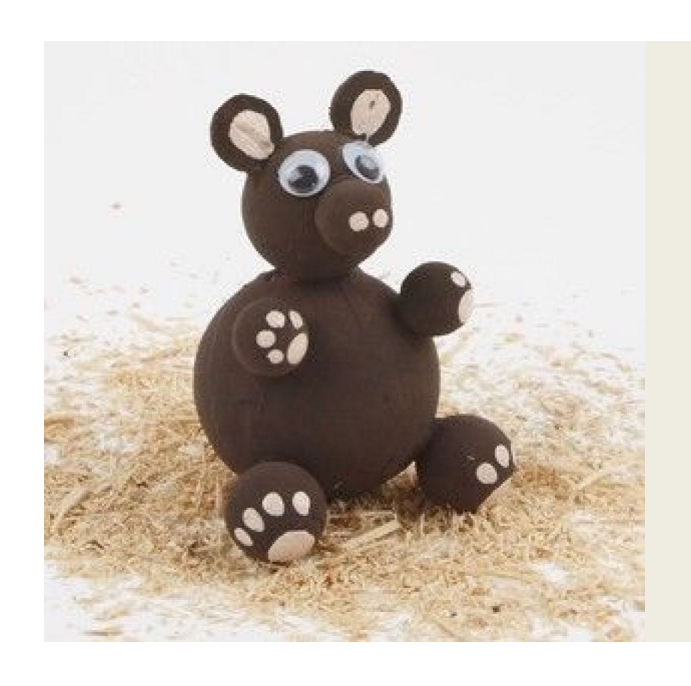
Dieren van katoenballen v1167