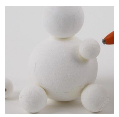
1 Glue cotton balls together to make an animal using a glue gun.