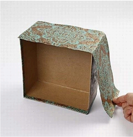
5 Glue on the next piece of paper exactly from one corner to the next. Always cut it a bit smaller, as the glue makes the paper expand