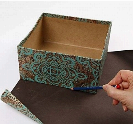
6 Measure the base, cut (slightly smaller) and glue on.