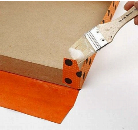
8 Fold down the flaps and glue in the order as shown.