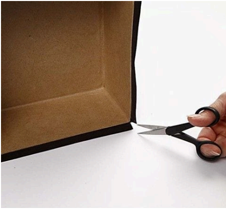
4 Cut a notch in each corner and fold down the flaps. Remember to glue.