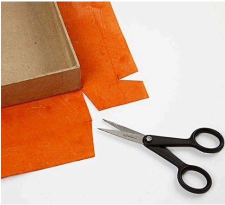
7 For the lid, cut away paper for the corner as shown.