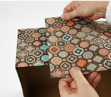
9 At the intersections on the largest boxes, the best result is achieved when you manage to get the pattern to fit. The edges abut or overlap 1cm.