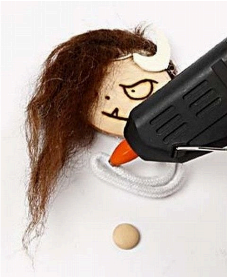
5 Use small buttons to glue on as hands and feet.