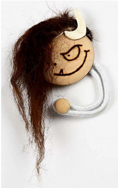
6 And done! One troll for the fridge.