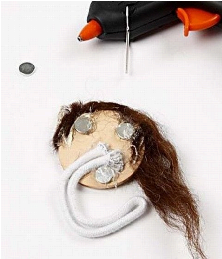
4 Glue 3-4 magnets onto the back.