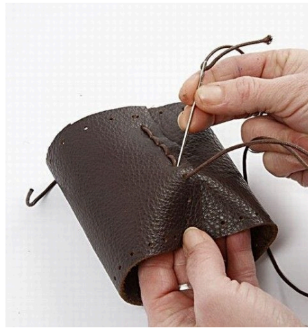
8 Cut a piece of cord measuring approx. 2.5 m. Sew the sides together, starting in the second hole.