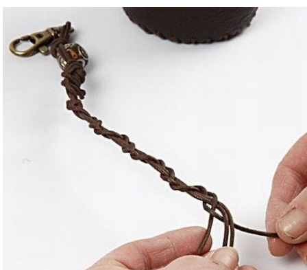
20 Plait around the two cords – approx. 1 meter.