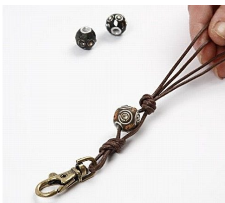
19 Pull a bead onto two of the cords and tie a knot.