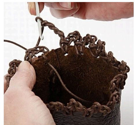
15 Crochet seven chain stitches in each hole.