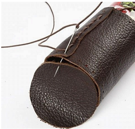
10 Insert the needle through the bottom and pull the string tightly to make it easier to manage the leather when making the holes. Fasten the last stitch temporarily.