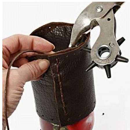
11 When making holes in the base, use the holes made in one end of the sewn cylinder. Make sure the bottom does not slip.