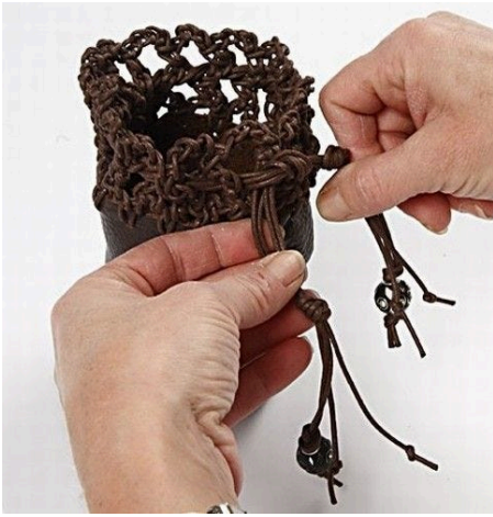
31 Attach beads and tie knots at the ends of each cord.