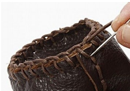
13 Finish the last hole and tie a knot on the inside.