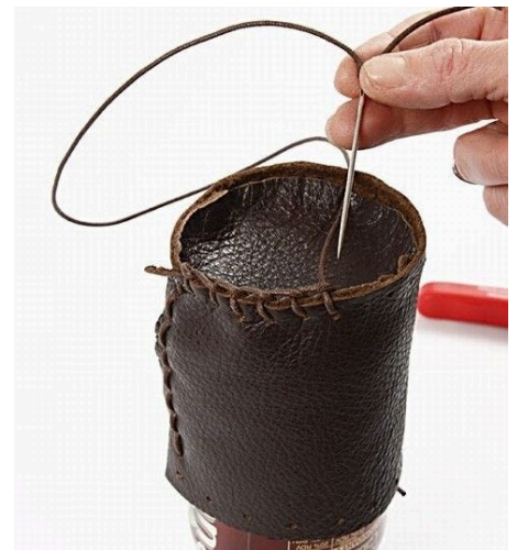
12 Sew the bottom on using buttonholing stitches.