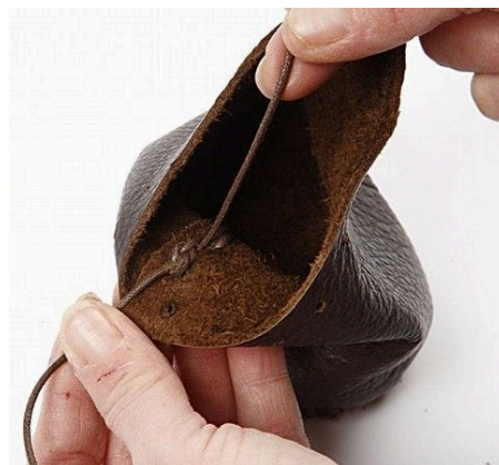
14 Crocheting the edge. Tie a piece of cotton cord onto the upper stitch.