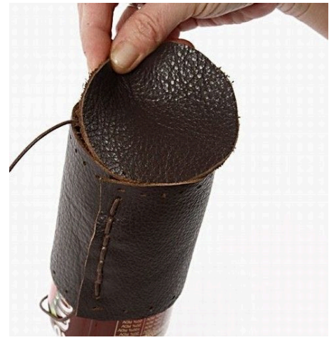
9 Insert the base.