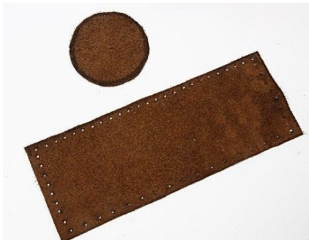
7 Ready for sewing.