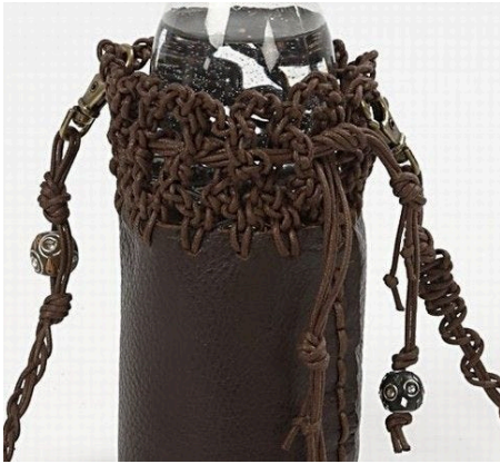
32 Attach the strap.