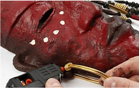
20 Use glue gun to attach an earring bent in Bonsai wire.