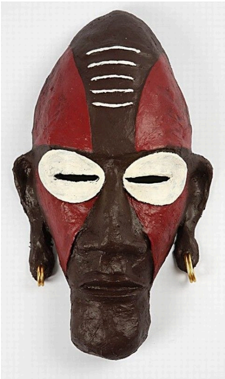
Variant of the mask This variant of the mask is made without hair and with more marked face painting. The possibilities are endless!