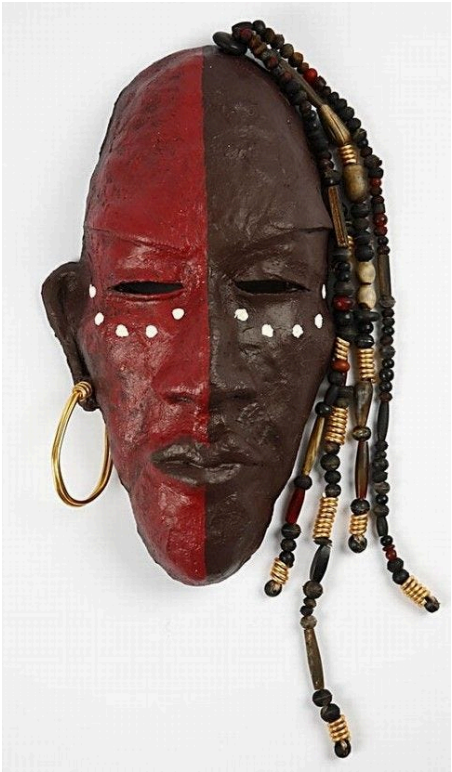
21 The finished mask.