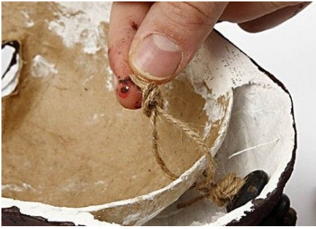
19 Attach a string through the hole for hanging.