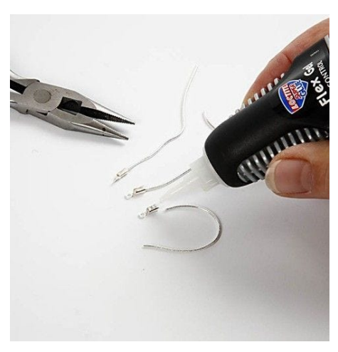
4 Cut three pieces of chain and glue them in place with Super Attak Instant Glue in their individual end caps. Squeeze the end cap slightly flat.