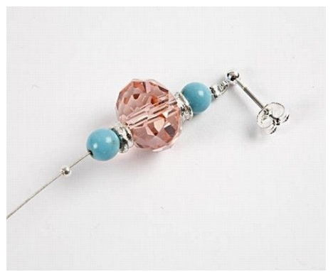
2 Thread beads and metal discs onto the beading wire and finally a crimp bead.