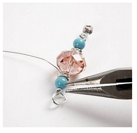
3 Thread the wire through a round jump ring, back through the crimp bead and a bead. Squeeze the crimp bead flat and cut off excess wire.