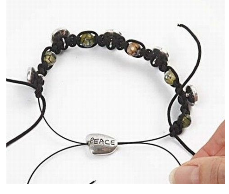
4 Thread the two ends of the thin cord through the metal text bead from each side.