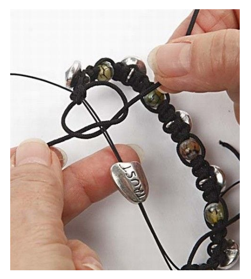
5 Continue braiding over the thin cords until the bracelet has the required length.