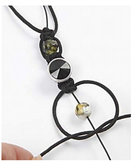
3 Finish braiding the bracelet and alternate between a stone and a button.