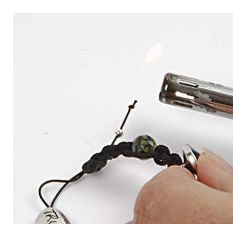
10 Tie a knot and melt this very carefully.