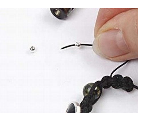
9 Lightly melt the end and thread on a mini silver bead.