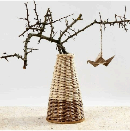
Another variant -