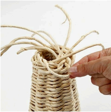
16. From the inside take out every maize cord and push it in again through the 3rd loop. Tighten.