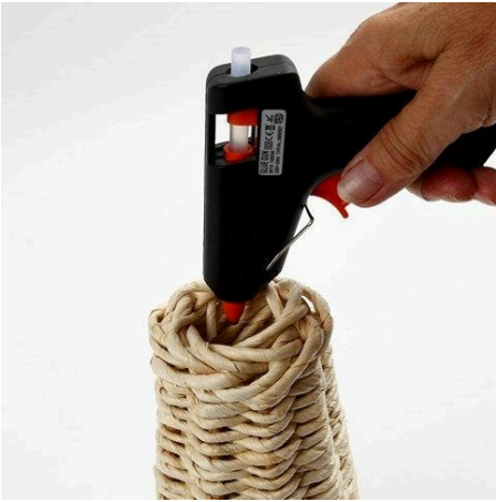
17. Tighten the weaving and trim all the ends at approx. 2-3cm. Push these into the edge all the way along. Use glue to secure the ends.